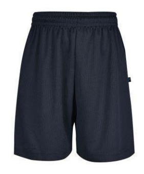
Navy Blue Rugby or Gaberdine Shorts/Skort