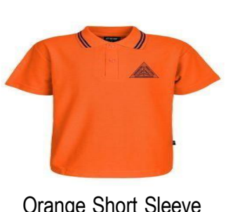
Orange Short Sleeve Polo Shirts

The wearing of school uniform is compulsory at Wooranna Park Primary School. For our full uniform, please see the school website. All our uniform pieces can be purchased at PSW, Unit 1, 9-11 South Link, Dandenong South, 3157