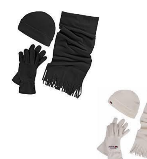
Gloves and Scarves (White, Black, Navy)