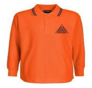
Orange Long Sleeve Polo Shirt