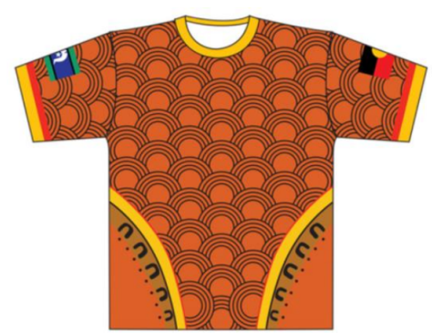
Polo = $41

ONLINE CLOSING DATE: SUNDAY 20th SEPTEMBER, 2024