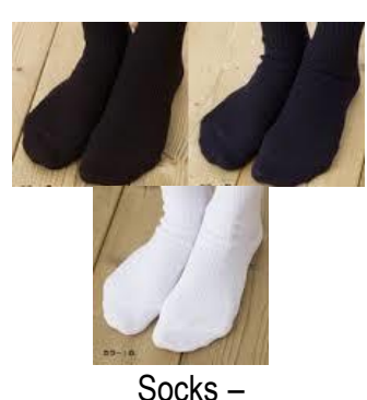
Socks – White, Black, Navy