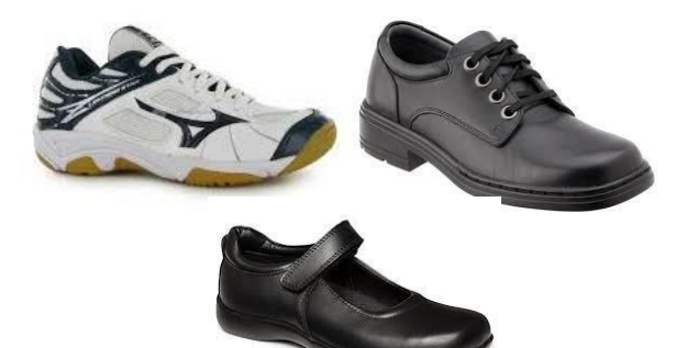
Sport Shoes or Black Shoes