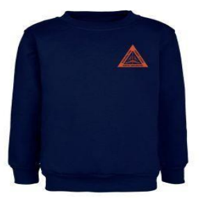
Navy Blue Windcheater