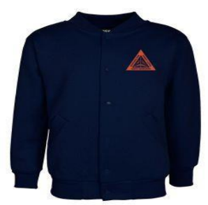
Navy Blue Bomber Jacket