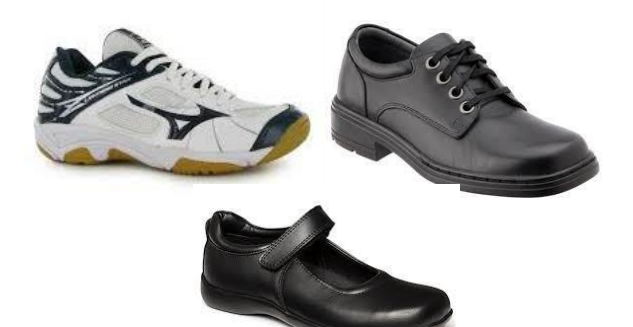
Sport Shoes or Black Shoes