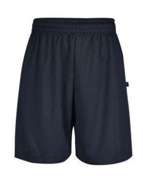
Navy Blue Rugby or Gaberdine Shorts/Skort