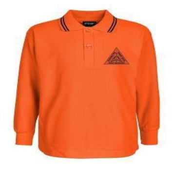
Orange Long Sleeve Polo Shirt