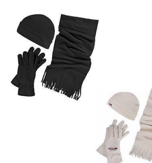
Gloves and Scarves (White, Black, Navy)