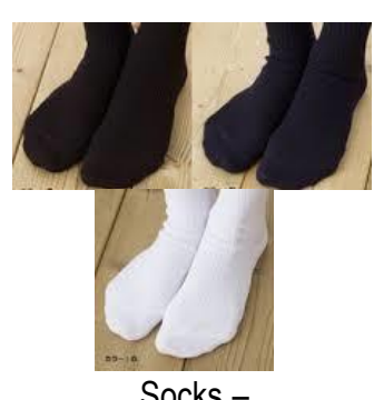
Socks -White, Black, Navy