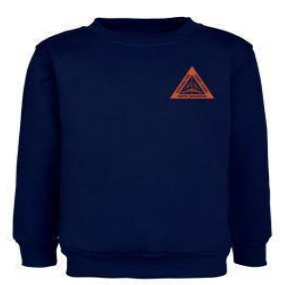
Navy Blue Navy Blue Windcheater