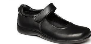
Sport Shoes or Black Shoes