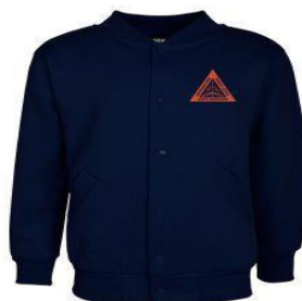
Navy Blue Bomber Jacket