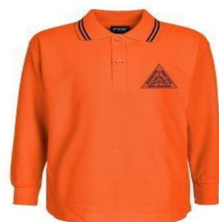
Orange Long Sleeve Polo Shirt