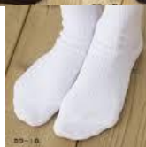
Socks – White, Black, Navy