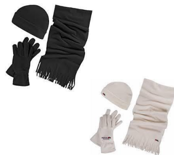
Gloves and Scarves (White, Black, Navy)

The following items are not permitted as a part of our uniform: