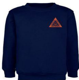
Navy Blue Windcheater