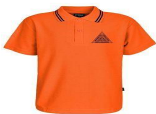
Orange Short Sleeve Polo Shirts

The wearing of school uniform is compulsory at Wooranna Park Primary School. For our full uniform, please see the school website. All our uniform pieces can be purchased at PSW, Unit 1, 9-11 South Link, Dandenong South, 3157