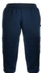
Navy Blue tracksuit pants/full length leggings No Jeans