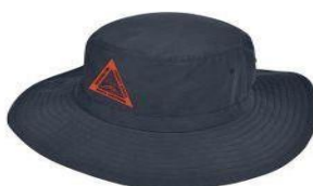
Navy Blue Hat