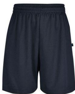
Navy Blue Rugby or Gaberdine Shorts/Skort